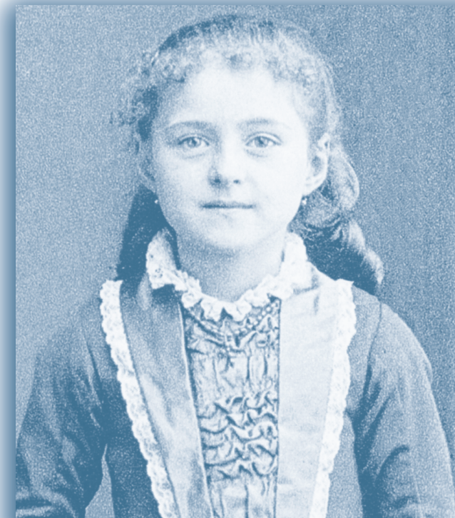
Diocese of Arlington